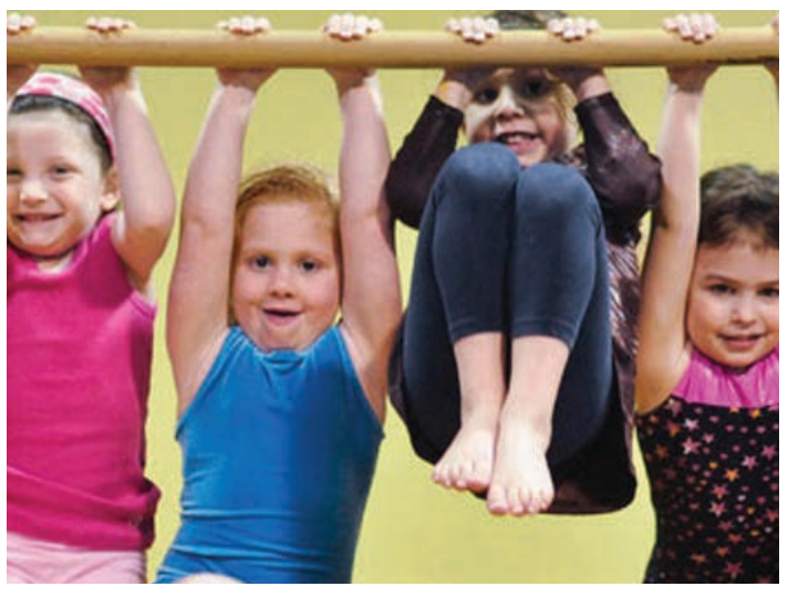
Gymnastics (Location: Simkus Recreation Center) Gymnastics classes are held through a joint program with the Carol Stream Park District at Simkus Recreation Center. We offer Ninja Classes, Cheernastics, Leveled Gymnastics and more available for ages 1-14. Check our website for new sessions beginning in September! (PS)